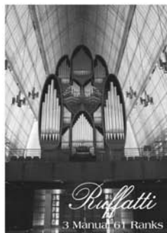
Fratelli Ruffatti Pipe Organs Padua, Italy

New 4 Manual Console to be interfaced with 45 Rank Casavant Pipe Organ at Sligo Seventh Day Adventist Church Takoma Park, Maryland